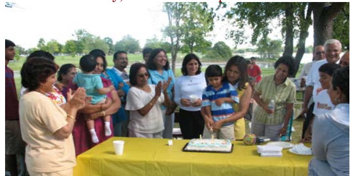
Michigan Chapter picnic & celebration